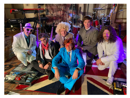
Her Majesty's Request